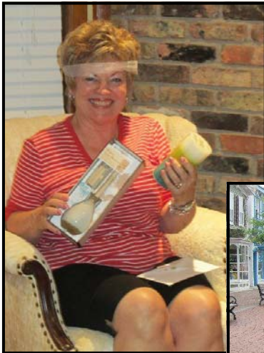
Girls just want to have fun....! From Jersey Shore to birthdays and beyond!