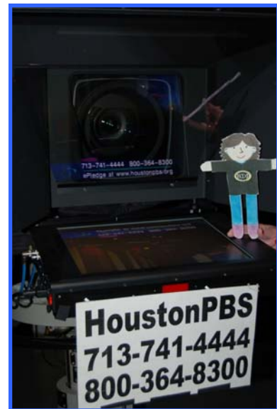
Sarah takes a short "behind the scenes" camera break while volunteering at the Houston PBS pledge drive.