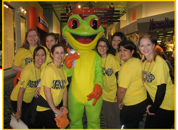
The ladies of Beta Lambda Phi raised over $1,000 for Walk MS 2010.