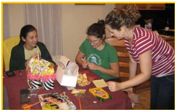
BLP gets ready for their MS Walk with a Slumber Party the night before.

From our Chapter to yours, we wish every single one of you and your family the most Joyous, Merriest and Blessed Christmas!