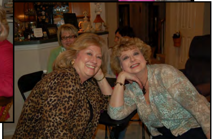
Crazy Bridge...or..."Crazy" Sisters???