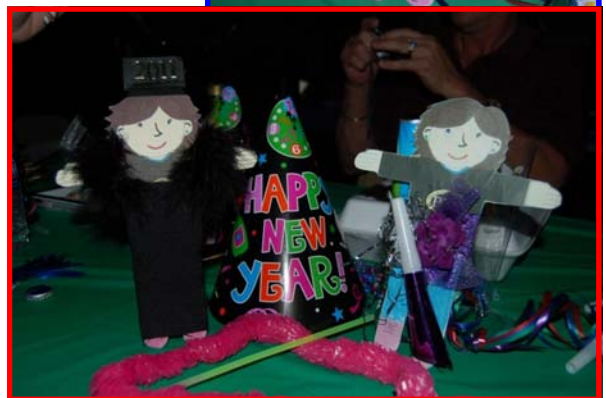
Are there 2 Sarah's now or is that from partying to much?