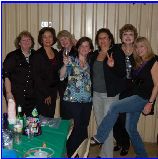
XAZ celebrates with a Christmas brunch at Carmelo's.