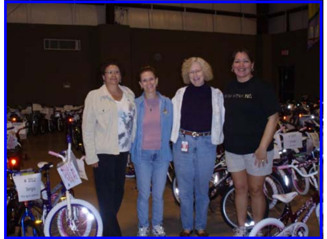
XPG members volunteered at the Katy Christian Ministries toy drive on December 3rd sorting toys for needy children.