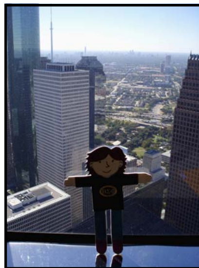
Sarah toured the JP Morgan Chase Tower Observation Deck on the 60th floor for an excellent aerial view of the city.